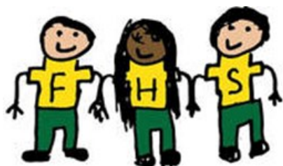
Friends of Horsley School

If you'd like to be involved in any capacity with either event please let us know via the FHS facebook page, or by emailing: teamfhs@outlook.com